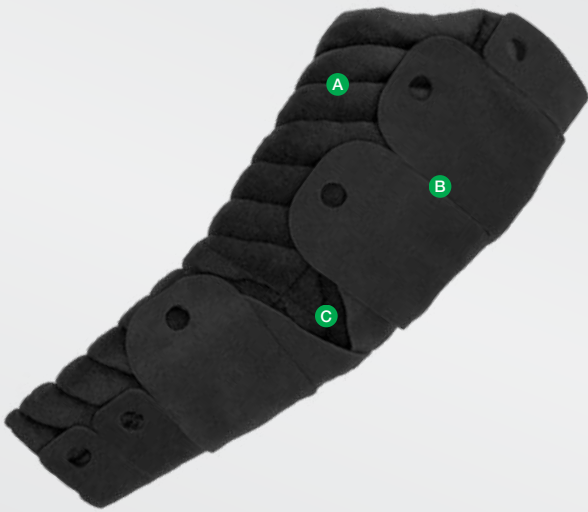
Tribute® Wrap Wrist to Axilla